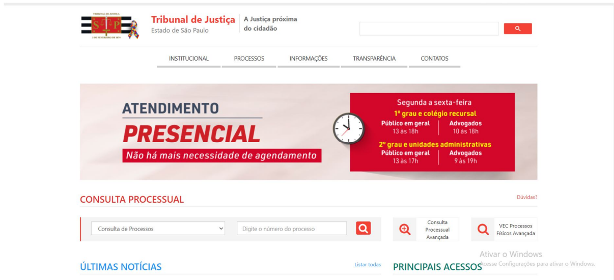
Figure 1. Website of the São Paulo State Court of Justice