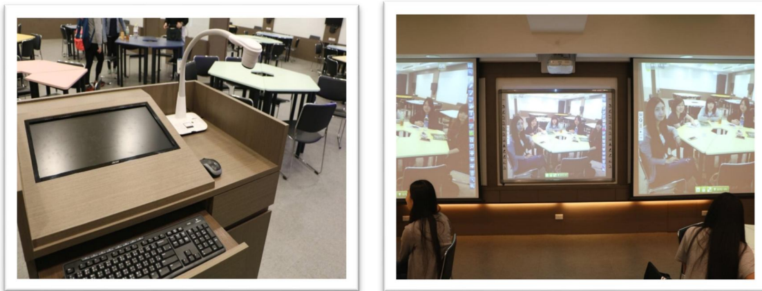
Figure 2: Teaching Facilities and Equipment

The upright information desk in the classroom enhances teachers' convenience, which reduces their burden and, hence, enhances the efficiency of the teaching applications. The interactive whiteboard is both a whiteboard and a computer screen, so that various computer operations can be performed directly on this interactive whiteboard. The teacher's lectures and computer software operations can be stored in the computer in real time, and the operation and lecture process can even be recorded and saved (see Figure 2). Three projectors are set up in the classroom so that students can clearly see the lecture materials from all angles. The teacher only needs to wear a sensor and can use the automatic tracking camera system to track the set targets and accurately lock them for recording purposes.