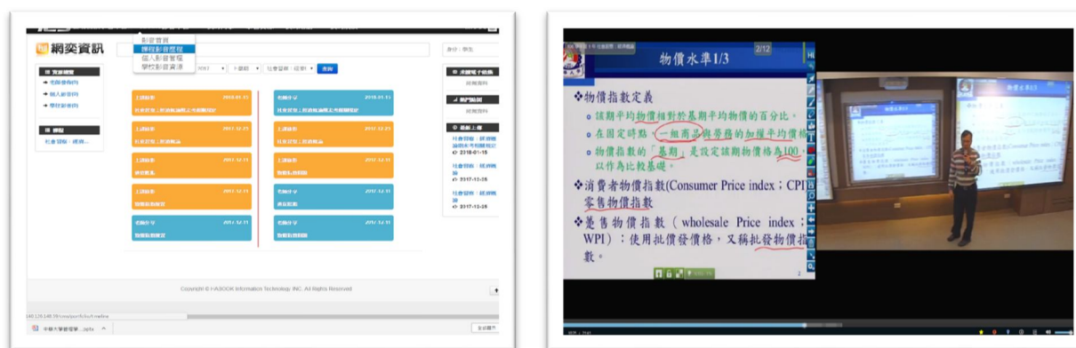
Fig. 4 Example of student screen and recorded videos on the learning platform

After the teaching activities are finished, the teaching records are automatically uploaded to the cloud for management. In addition, teachers can record and share the complete course through the recording system, so that students can review the course themselves through the cloud learning platform. In addition, students' personal learning history is completely recorded and analyzed on the cloud-based learning platform, enabling teachers to grasp the status of their revision after class (see Figure 4).