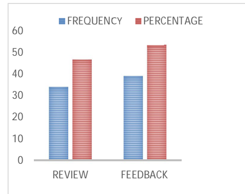
Figure 1: Teachers' responses on methods used to integrate CATs in teaching and learning English Language in Class Seven

According to the responses, 39 (53.42%) teachers used feedback as a means of summarizing their lessons. This was done by the use of oral and written questions as the lesson progressed and at the conclusion of the lessons. However, the study established that 34 (46.58%) teachers used both review, reflection and feedback methods to begin and to end their lessons respectively. This variety of methods helped in reinforcing teaching and learning of English language in class seven. The study found out that feedback method was the most commonly used by teachers of English in teaching and learning of English language in class seven in Awendo Sub-County as teaching method.