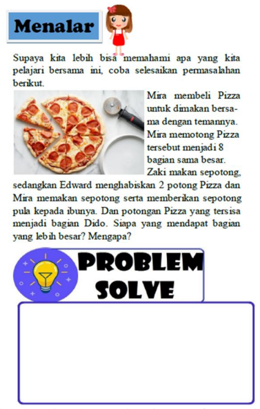
Figure 4: Display in the "Digging Information" Stage

That way, students will try to reason the fraction abilities that they get from interactive multimedia that they have listened to. He must also look for problem solving from the given problem.