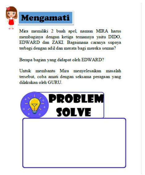
Figure 2: Display in the "Observing" Stage

Furthermore, from the results of observations and problem solving that have been carried out in the previous stages, at this stage students are invited to ask questions that they have not yet understood. The questioning stage contains activities for writing questions that students may have. The following is an example of a screenshot in the questioning stage.