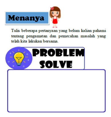
Figure 3: Appearance at the "Asking" Stage

Furthermore, from the results of observations and problem solving that have been carried out in the previous stages, at this stage students are invited to ask questions that they have not yet understood. The questioning stage contains activities for writing questions that students may have. The following is an example of a screenshot in the questioning stage.