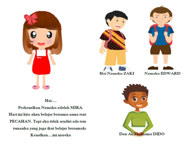
Figure 1: Introducing Figure in a Problem-Based Interactive Module

The Problem Based Interactive Module produced by researchers is designed by using figures which are also used in problem based interactive multimedia in previous studies. Following are some of the figures used in the problem-based interactive module.