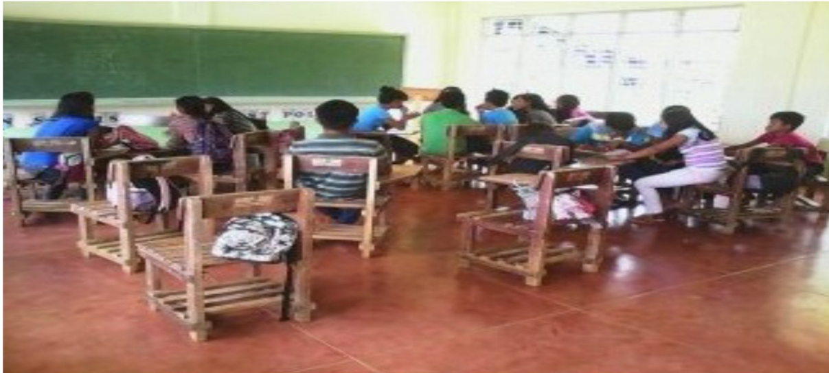
Plate No. 4 Students on the process of learning

The ICT based technological and pedagogical framework helps engage students' curiosity and initiate learning to critical and analytical thinking. ICT-based learning linked to constructivism paradigm today (Kharade & Thakkar, 2012). The claim of Kharade & Thakkar (2012) is anchored to Bruner (1977) that the curriculum should be designed from simple to complex and requires revisiting prior knowledge. Its knowledge is considered to be socially as well as individually constructed. The focus of schools' management should be on the development of a suitable environment for constructing knowledge rather than for its transfer. Thus, the efficiency and effectiveness of schools' management and students' academic performance in integrating ICT are the basis of schools' performance.