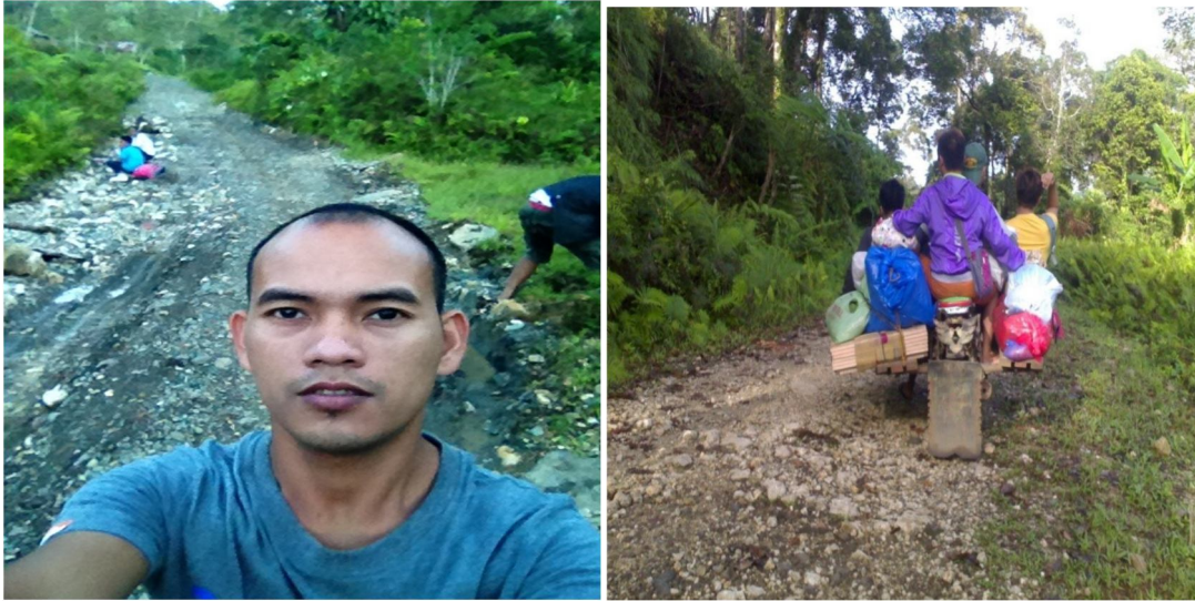
Plate No. 5 From left: a selfie of the researcher at Kilometer 8, a road going to site of the study, and teachers' riding on Habal-habal

The Southern part of the municipality of Lanuza, Surigao del Sur, Philippines, riding through "Habal-habal" (motorcycle), about 22 kilometer and 2 hours to travel from Barangay Puyat of Carmen, the neighboring municipality of Lanuza, people can reach Barangay Pakwan, Lanuza, Surigao del Sur where Pakwan Integrated School (PIS) is located. Among the four secondary campuses of Lanuza District, Pakwan Integrated School (PIS) is located in remote and most risky place because of its rocky, rough, and slippery road. It takes 3 kilometers from the barrio before you can reach the area with phone signal. Different Non-Government Organizations provided electricity of this place through solar, such as MERALCO Foundation, and PAMANA Project (Daling, 2016). As to experience, the road going to the site is prone to landslide when rainy season.