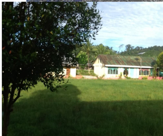
Plate No. 6 from left: Teachers on Text Mountain Site, 3 km. from the main site of the study (photo courtesy by Rudy Daling), and a school building of Pakwan Integrated School installed with solar panel, Date taken Feb. 07, 2017(photo courtesy by Rudy Daling)