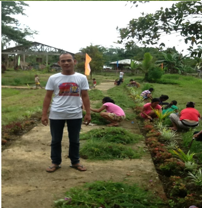
Plate No. 1 from left, The Site of the study, and The researcher on the site of the study