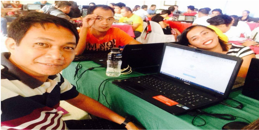
Plate No. 2 Teachers on Division Training of Trainers for ICT, Taken last September 2016

school, to capacitate every educator in teaching-learning process with ICT integration, and planning responsibilities and duties that ICT requires in achieving goals.