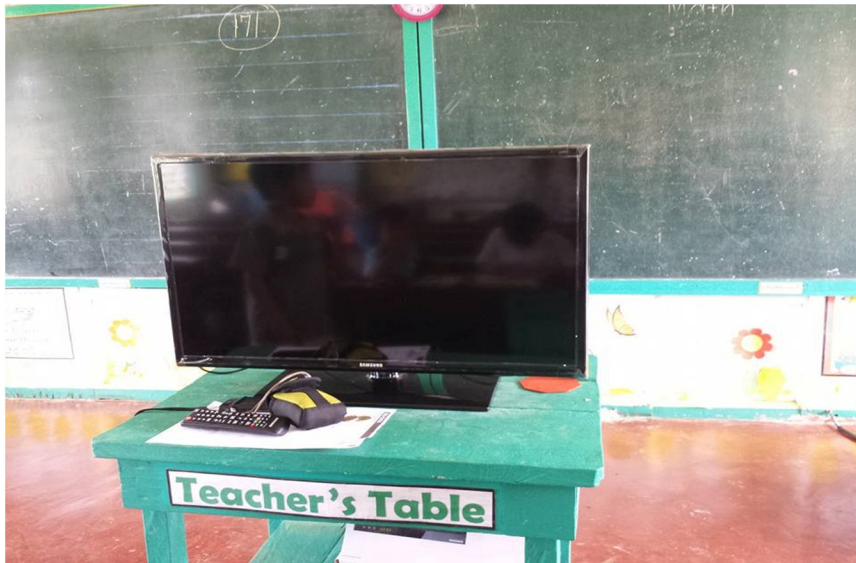
Plate No. 7 a flat screen television ready for teacher's class presentation which was commonly intervention in the absence of OHP

(OHP). There were few laptops that shared by teachers, and some have personal laptops in preparing lessons and paper works, such as monthly reports.