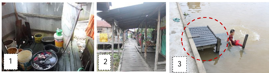
Figure 2. Pembanyuan (1), titian (2) and batang (3)

Houses on the riverbanks have batang as a service area that connects directly with the river located behind or beside the house. On houses on the edge of the land some have batang , and some do not. Those that have batang are the houses that are still inundated by water at low tide. The position of the batang is in front of the house.