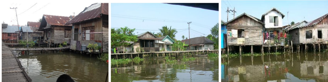
Figure 1. The stilts house on riverside

The most common type of house found in riverside settlements is house on stilts with construction poles of more than 2 m long in anticipation of the river. There are two types of stilt houses based on their position on the river: stilt houses on the riverbanks and stilt houses on the edge of the land. Stilt house on the riverbanks is above the river body with orientation to the titian (path with pole structure) and its back to the river. The stilt house on the edge of the land is located between the riverbank and the mainland. During high tide there will water below the house, but at low tide there will land. The edge of land stilt house is oriented towards the river.